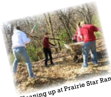
Cleaning up at Prairie Star Ranch

It was a beautiful sight to see thirteen yellow school busses pull up in front of St. James Academy Friday morning April 3rd, to haul the entire student body and numerous parent volunteers, to do God's work all across the metro area and beyond.