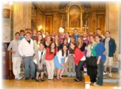
Our first Mass at St. Ann's inside the Vatican's Wall

They took morning walks through Rome visiting many churches, Campo dei Fiori, Casa Santa Maria Residence for American priests, Trevi Fountain and the Spanish Steps. They visited three major basilicas; St. John Lateran and the Holy Stairs, St. Paul's, and they celebrated Mass at St. Mary Major.