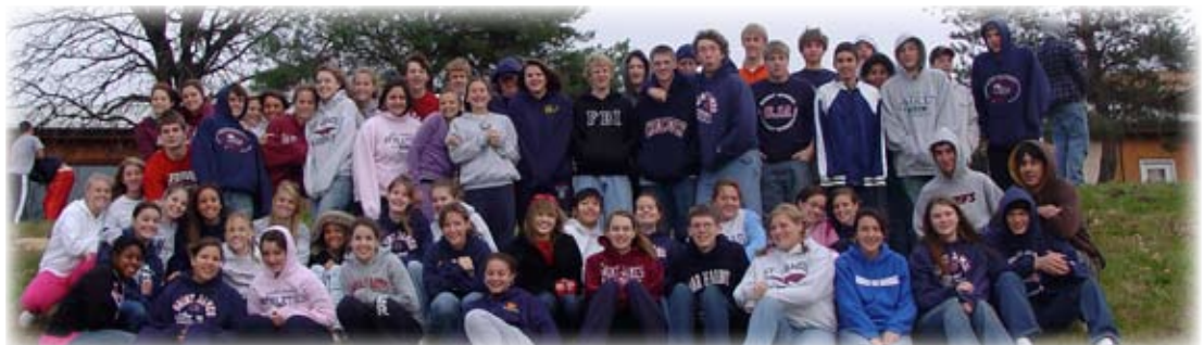
Freshmen Retreat 2006

"... but if I could just magically measure your students' hearts for growth, I'll bet my thermometer would go off the chart!"