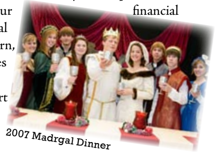
2007 Madrgal Dinner

For these, and many other reasons too complex to explain here, St. James Academy needs your donation. As we've grown so quickly, and since there were multiple unanticipated expenses associated with opening a new high school, our current financial status has not met projections. This fourth year of operations is about to close and we are seeking assistance to improve our financial position. The gap between tuition and actual cost per student is significant. A traditional high school makes up the difference through fundraising. Due to the economic downturn, our fundraising effort, to date, has fallen short. This "Make a Difference" Appeal replaces two traditional fundraising events conducted in past years, the Zeal Appeal and the Thunder Classic golf outing. Both have been suspended in order to focus time and effort to this low-expense, high-reward fundraiser.