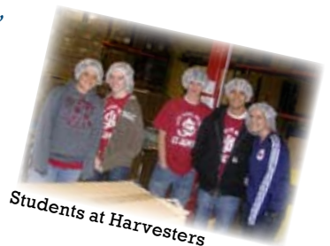
Students at Harvesters