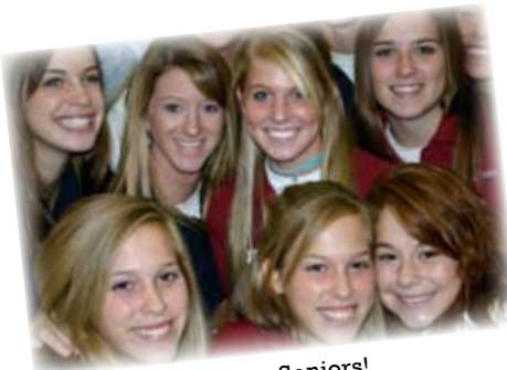
Freshmen girls, now Seniors!

"I am so grateful for the sense of family/community/friendship that you all are fostering at St. James Academy; as that sense of family unity is one of the main reasons we have our children in the Catholic School system."