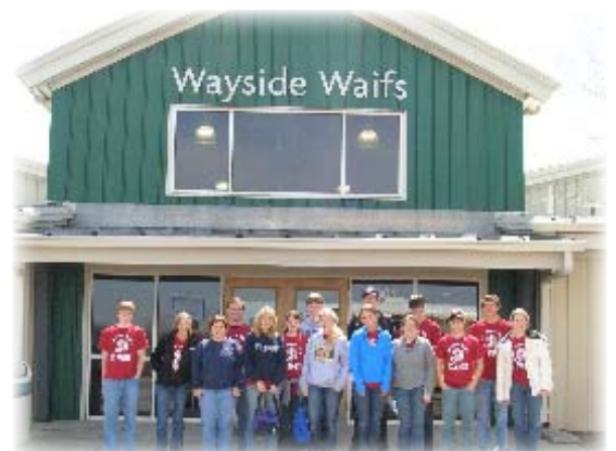
St. James Students making a difference at Wayside Waifs

As the busses returned to St. James, it was an even more beautiful sight to see the beauty in the good the students had done that day, as it is in giving that we truly receive.