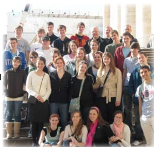
Outside St. Peter's Basilica