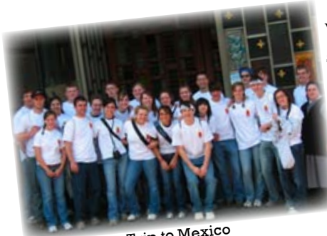
2008 Mission Trip to Mexico

YOU can Make a Difference! All St. James Academy friends are needed to Make a Difference. Everyday, St. James Academy Makes a Difference in 565 students' lives. Help us continue to serve the students and provide the programs our students deserve, guaranteeing them the very best education and faith development experience we can offer.